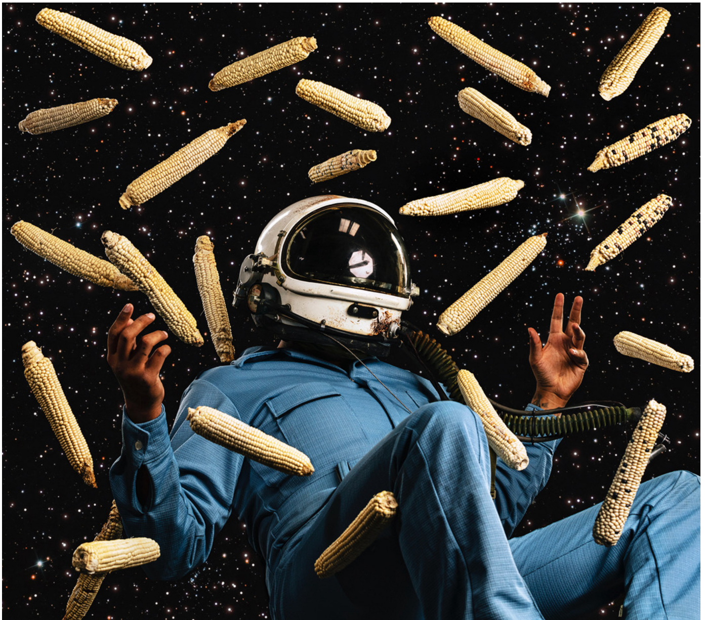
Cara Romero, "The Zenith" (2022) (© Cara Romero; image courtesy Bockley Gallery and Fotografiska)